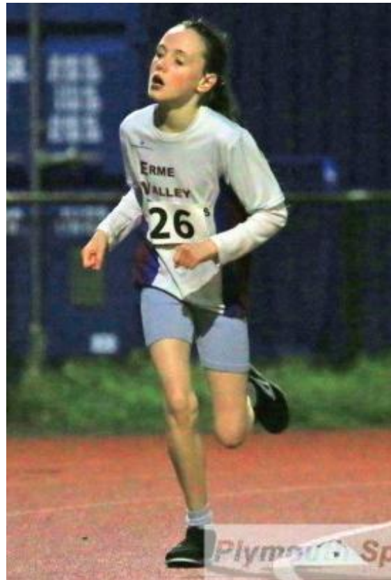
Plymouth – mile races