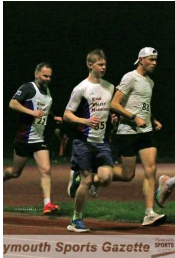
Plymouth – mile races