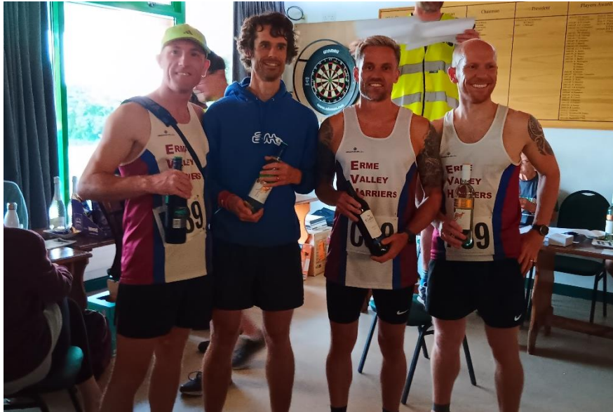
Our Men's 40 and Ladies 45 teams